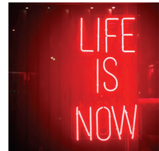
6 NUOVE GRAFICHE